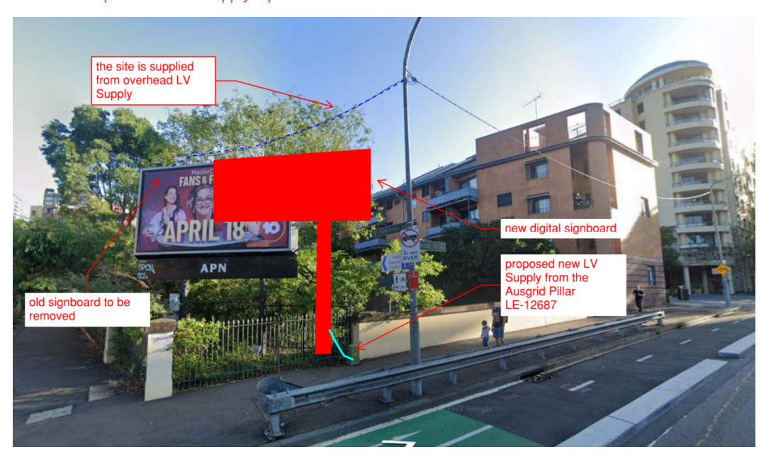
Sketch 2 Proposed Power Supply Option

During the detailed design, connection of load application to be submitted to Ausgrid to confirm the available load for the existing pillar and supply point.